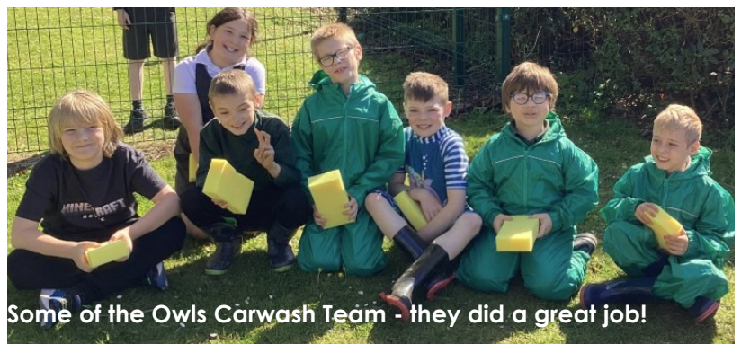
Some of the Owls Carwash Team - they did a great job!

Owls class have had a very busy term! We have been doing lots of learning about where we live and our local area, We have been exploring stories about people travelling the world and we have been focusing on measuring weight and capacity in maths! We enjoyed a trip to the post box and learnt about the difference in sending email and letters. We have all enjoyed watching the chicks hatch and grow. We have also been busy planning lots of fundraising activities to help fund our new playground - a staff carwash event, cake sale and a stall at the Easter Fun Day. Have a wonderful Easter!